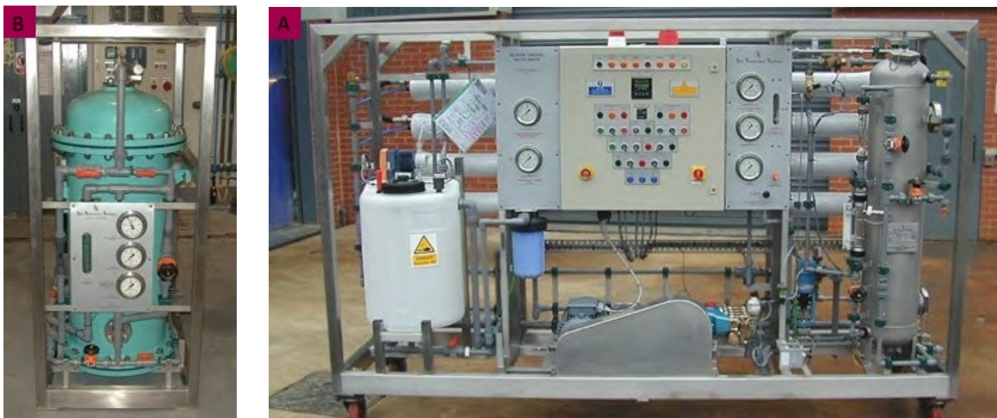
Figure 1: Images of Rothera plant (A. Sand filter and B. RO unit).

The normalized permeate flow remained very stable during the data collection timeframe, indicating no effect of long term low temperature operation.