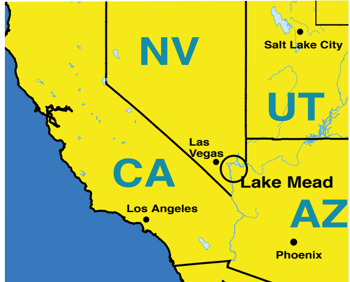
Overton Beach Marina, Overton, Nevada